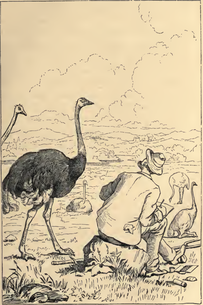
SKETCHING UNDER DIFFICULTIES.—PAGE 76.